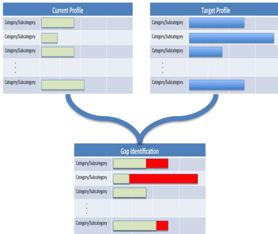
Figure 2: Profile Comparisons