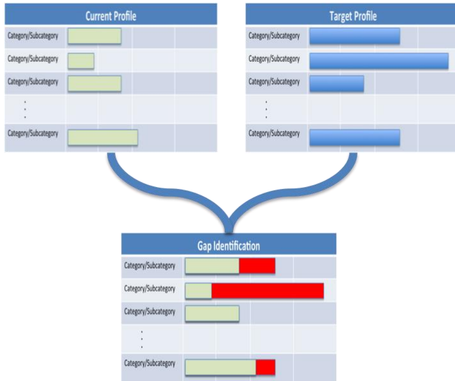
Figure 2: Profile Comparisons